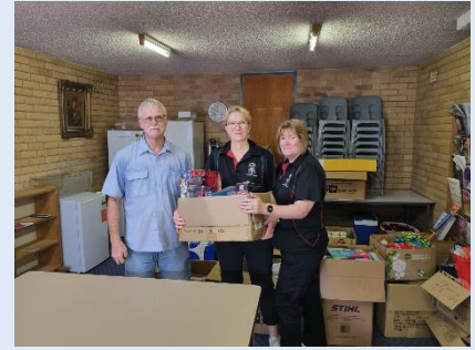
St Martin's Primary School & San Sisto College supporting the St Vincent de Paul Christmas Appeal.